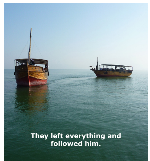
They left everything and followed him.